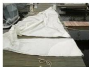
Torn Sail? Sportech can fix that!