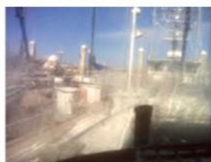
Cloudy Windows? Sportech can fix that!

Ask about the HAPPY PAC ~ The most versatile stacking sail cover.