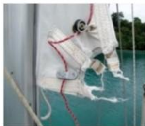
Clewless Sail? Sportech can fix that!