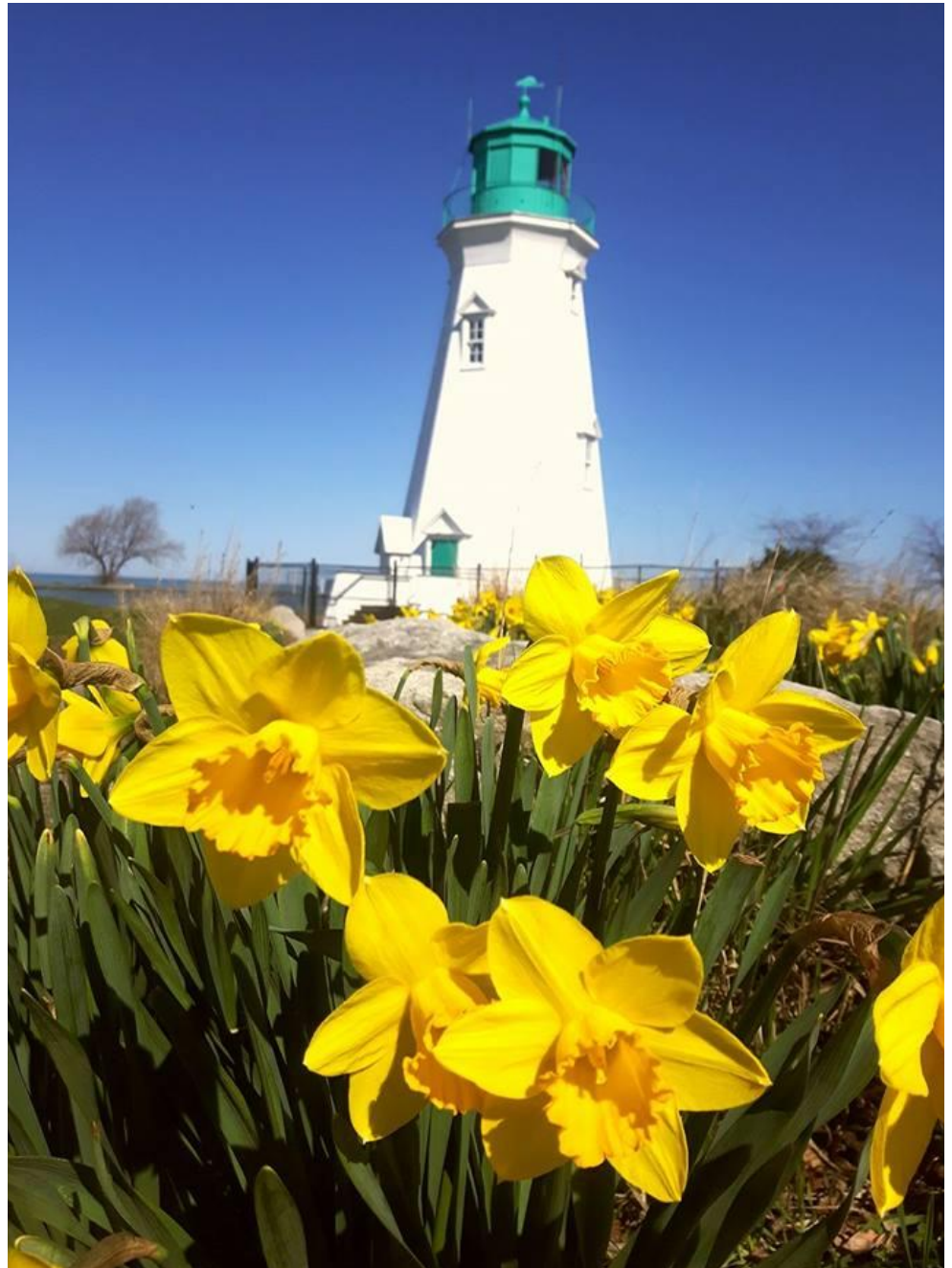
Spring in Port Dalhousie.

Sunset Dining Room Hours Wednesday through Saturday Noon to 9 p.m.