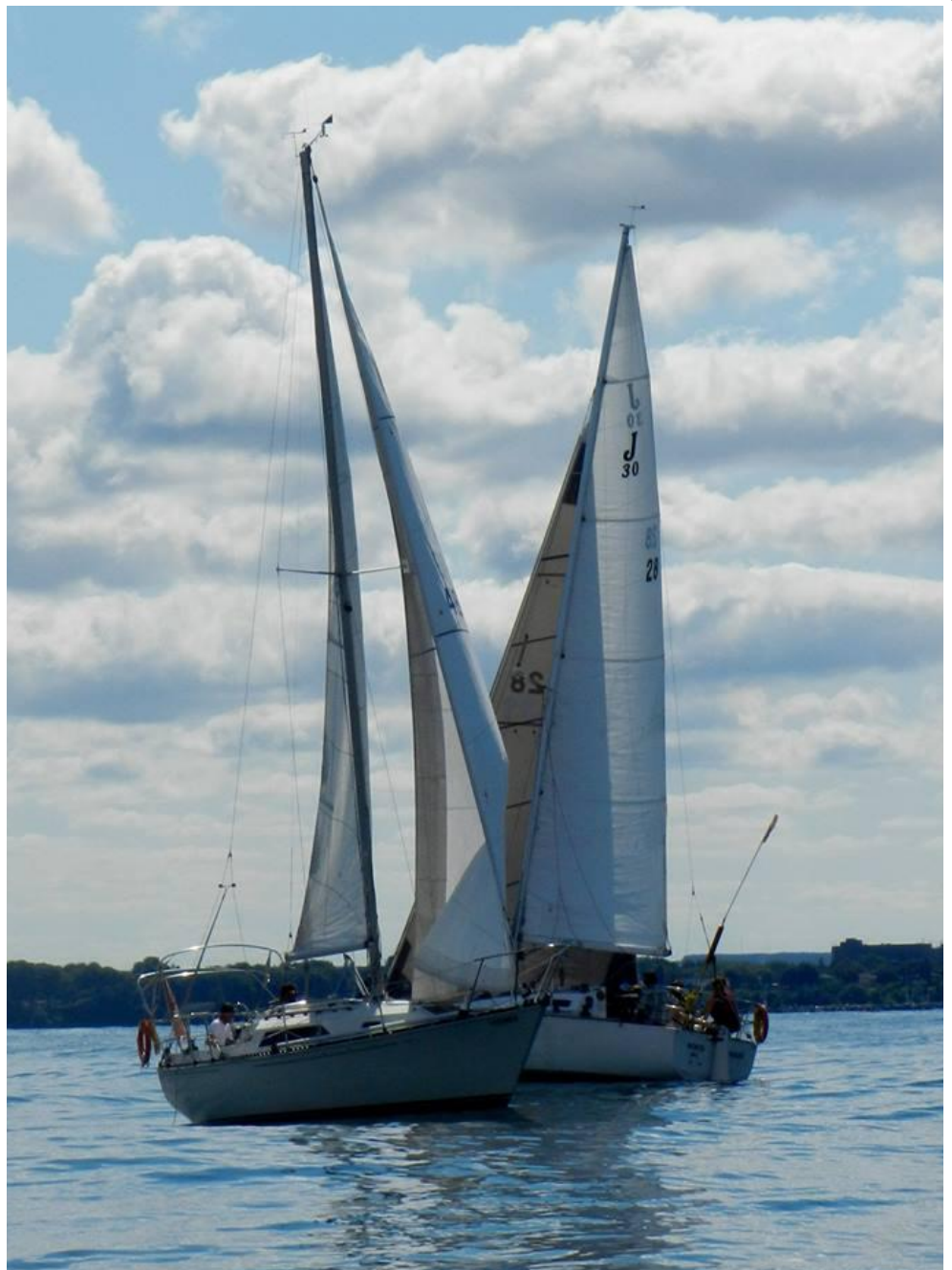
More photos in this issue.