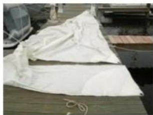
Torn Sail? Sportech can fix that!