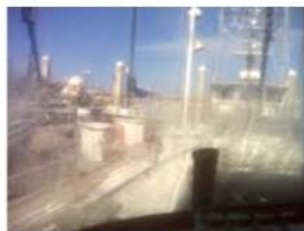
Cloudy Windows? Sportech can fix that!

Ask about the HAPPY PAC -- The most versatile stacking sail cover.