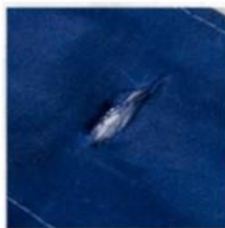
Ripped canvas? Sportech can fix that!