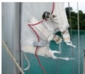
Clewless Sail? Sportech can fix that!